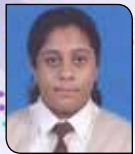
PIONELLE ANNIE 10G - JAN 3