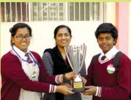
3rd - 9A