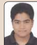
CLETUS - 10F