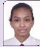
MELITA - 10G