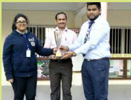
3rd - 12J