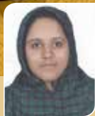
Tasnim - NIOS Class XII Topper

The EPIC Team interviewed the following NIOS students to get the feed back and this is what they said.