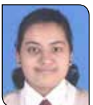
BLOSSOM 12C - JAN 10