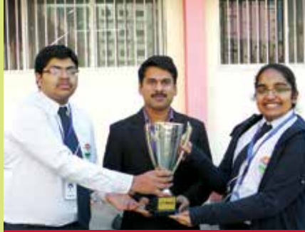
1st - 11B