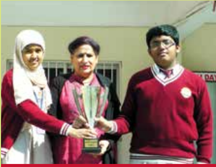
1st - 8A