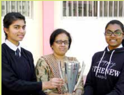
2nd - 11G