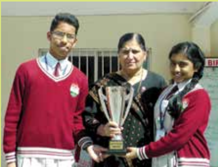
3rd - 8C