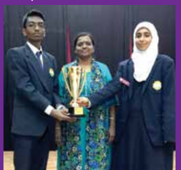
FIRST - 12J (SEN. SEC.)