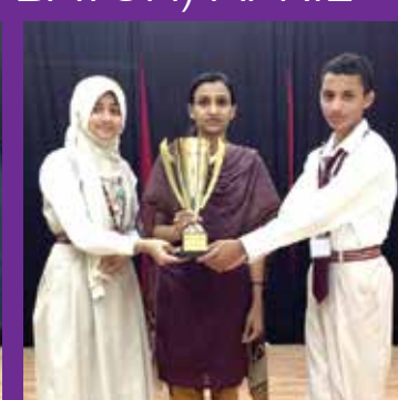
FIRST - 7F (SEC.)