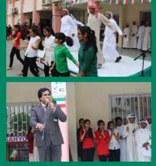
Liberation Day of Kuwait. Annually, Kuwait celebrates the whole month of February as their joyous Hala February.

Every year, 25th February is celebrated as the National Day and 26th February as the