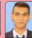
HYDER ALI 12K - APR 22