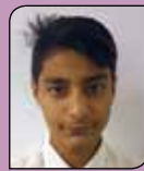
HASHEER - 10F